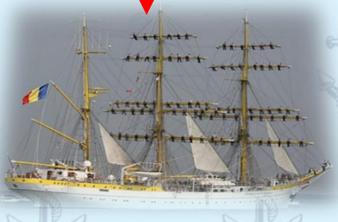
Training Ships Squadron