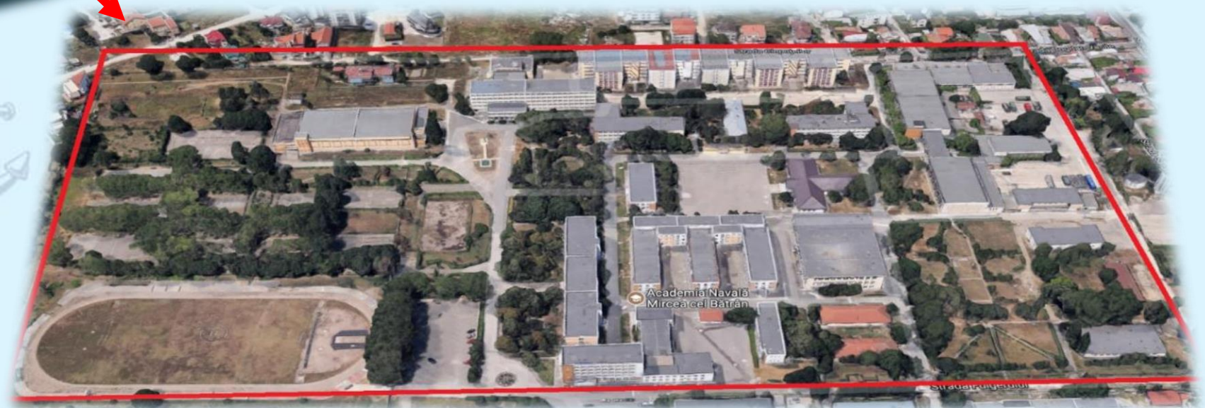
Main Campus – ACADEMIC CAMPUS