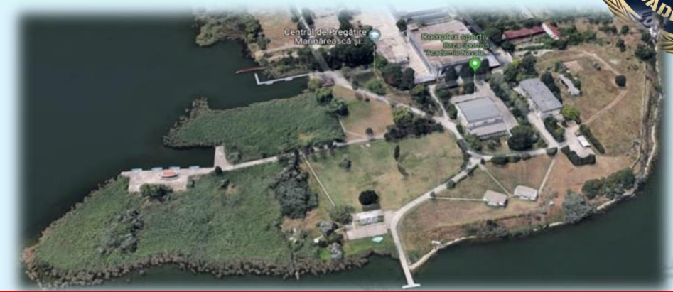
Seamanship and Nautical Sports Center - Palazu Mare